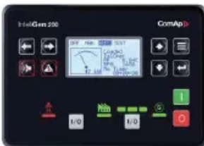
ComAp IntelliGen 200

ComAp IntelliGen 200 Controller family for synchronising and power management applications, supporting multi controller operation, PLC functionality, and remote connectivity depending on the selected variant.