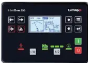
ComAp IntelliGen 200

ComAp IntelliGen 200 Controller family for synchronising and power management applications, supporting multi controller operation, PLC functionality, and remote connectivity depending on the selected variant.