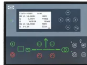
DEIF AGC 150

DEIF AGC 150 Alternative AMF controller option, typically chosen when a DEIF based control platform is preferred for the project.