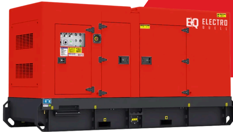
Illustrative image. Actual product details may differ from the illustration.