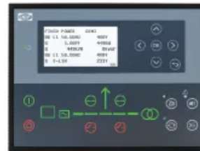
DEIF AGC 150

DEIF AGC 150 Alternative AMF controller option, typically chosen when a DEIF based control platform is preferred for the project.