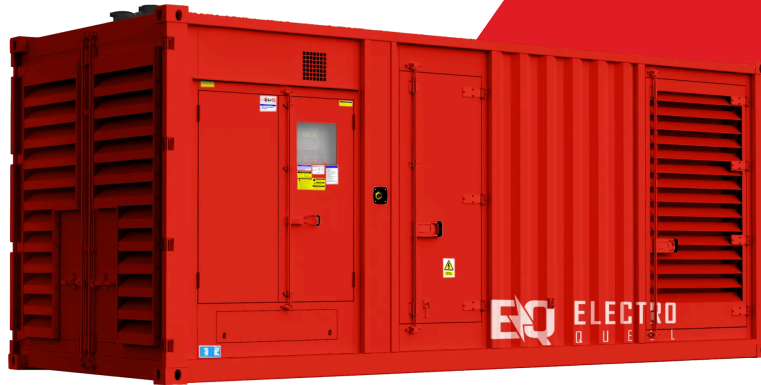
Illustrative image. Actual product details may differ from the illustration.