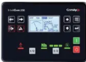
ComAp IntelliGen 200

ComAp IntelliGen 200 Controller family for synchronising and power management applications, supporting multi controller operation, PLC functionality, and remote connectivity depending on the selected variant.