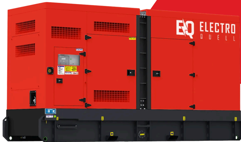
Illustrative image. Actual product details may differ from the illustration.