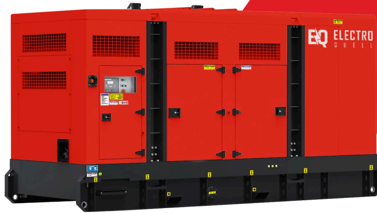
Illustrative image. Actual product details may differ from the illustration.