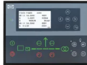
DEIF AGC 150

DEIF AGC 150 Alternative AMF controller option, typically chosen when a DEIF based control platform is preferred for the project.